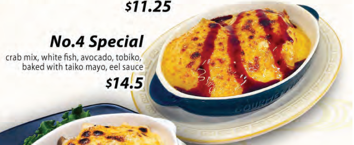
No.4 Special crab mix, white fish, avocado, tobiko, baked with taiko mayo, eel sauce