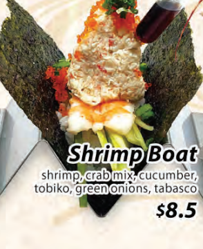
Shrimp Boat shrimp, crab mix, cucumber, tobiko, green onions, tabasco $8.5