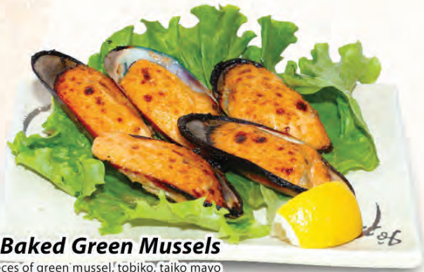
Baked Green Mussels 5 pieces of green mussel, tobiko, taiko mayo