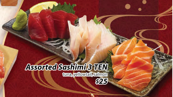
Assorted Sashimi 3 TEN tuna, yellowtail, salmon $25