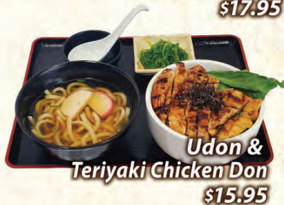
Udon & Teriyaki Chicken Don $15.95