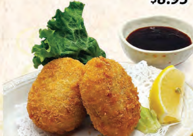
Clam Chowder Croquette 2 pieces of croquette, tonkatsu sauce $6.95