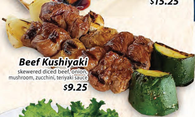
Beef Kushiyaiki skewered diced beef, onion, mushroom, zucchini, teriyaki sauce $9.25