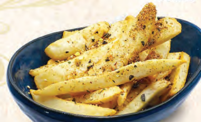
Furikake French Fries french fries, furikake, taiko mayo $6.25