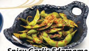
Spicy Garlic Edamame Regular Edamame 6.25