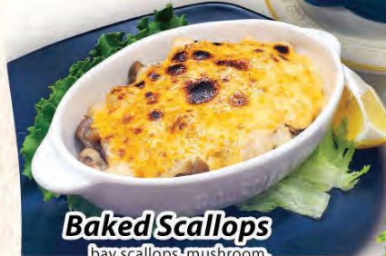
Baked Scallops bay scallops, mushroom, tobiko, taiko mayo