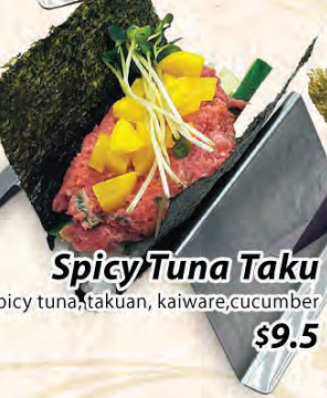
Spicy Tuna Taku spicy tuna, takuan, kawaiire, cucumber $9.5