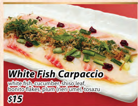
White Fish Carpaccio white fish, cucumber, shiso leaf, bonito flakes, plum (neri ume), toszu $15