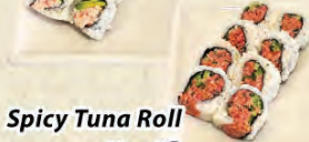
Spicy Tuna Roll Plus $2