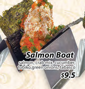
Salmon Boat salmon, crab mix, cucumber, tobiko, green onions, tabasco $9.5