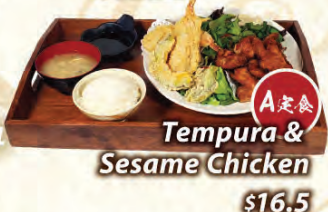
A 定食 Tempura & Sesame Chicken $16.5