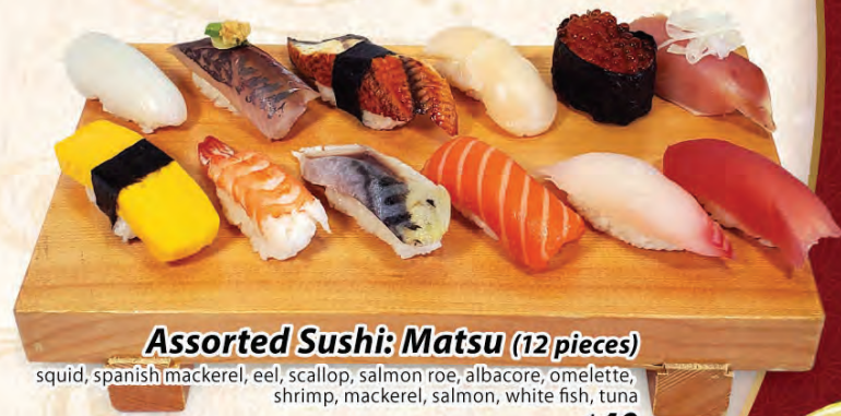
Assorted Sushi: Matsu (12 pieces) squid, spanish mackerel, eel, scallop, salmon roe, albacore, omelette, shrimp, mackerel, salmon, white fish, tuna $40