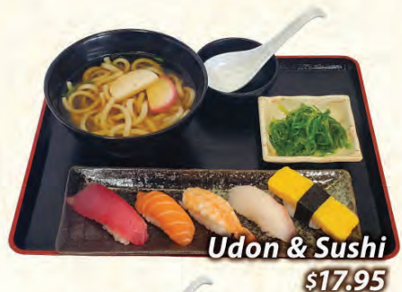
Udon & Sushi $17.95