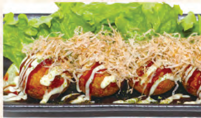
Takoyaki 5 pieces of octopus ball $9