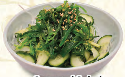
Seaweed Salad cucumber, seaweed, ponzu, tsuma $8.5