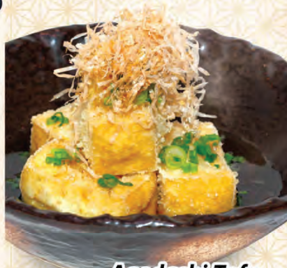
Agedashi Tofu deep fried tofu, bonito flakes, green onions, ginger, dashi soup (soy sauce, mirin, sake, fish) $8.25