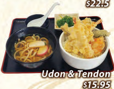
Udon & Tendon $15.95