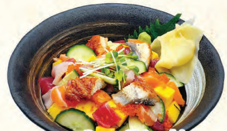
Bara Chirashi scattered small cut fish on sushi rice $19