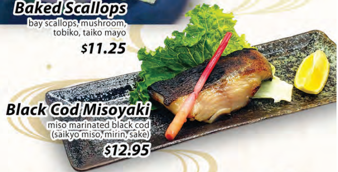
Black Cod Misoyaki miso marinated black cod (saikyo miso, mirin, sake)