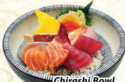
Chirashi Bowl tuna, salmon, albacore, white fish shrimp, surf clam, tobiko, omelette, sushi rice $22