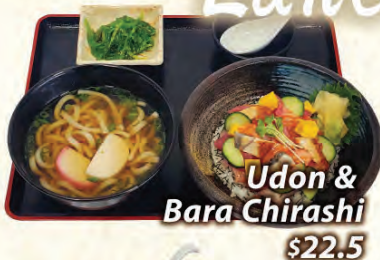
Udon & Bara Chirashi $22.5