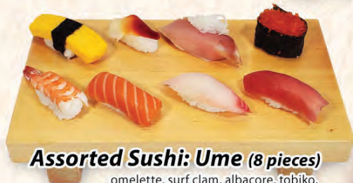
Assorted Sushi: Ume (8 pieces) omelette, surf clam, albacore, tobiko, shrimp, salmon, white fish, tuna $22