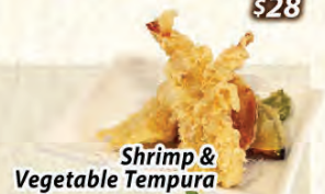
Shrimp & Vegetable Tempura