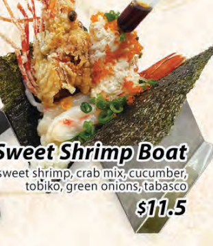
Sweet Shrimp Boat sweet shrimp, crab mix, cucumber, tobiko, green onions, tabasco $11.5