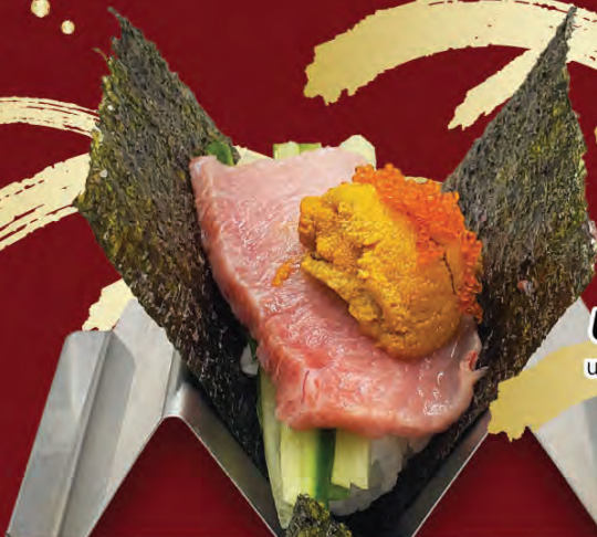
Uni-Toro uni, toro, tobiko, cucumber $20