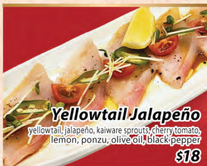
Yellowtail Jalapeño yellowtail, jalapeño, kaiware sprouts, cherry tomato, lemon, ponzu, olive oil, black pepper $18