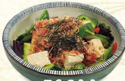
Tofu Salad tofu, salad mix, cherry tomato, bonito flakes, nori, sesame dressing $11