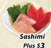
Sashimi Plus $3