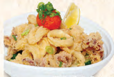
Fried Calamari deep fried calamari, cucumber, green onions, ponzu, grated radish with red chili (momiji oroshi) $11.5