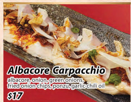
Albacore Carpaccio albacore, onion, green onions, fried onion chips, ponzu, garlic chili oil $17