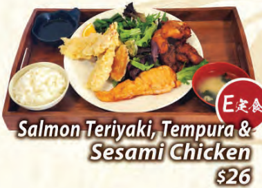
E 定食 Salmon Teriyaki, Tempura & Sesame Chicken $26