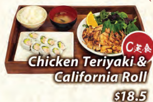
C 定食 Chicken Teriyaki & California Roll $18.5