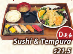
D 定食 Sushi & Tempura $21.5