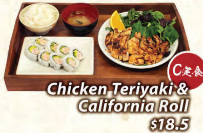
C 定食 Chicken Teriyaki & California Roll $18.5