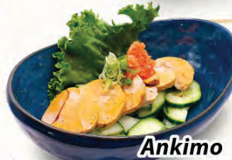
Ankimo steamed monkfish liver, ponzu, green onions, grated radish with red chili (momiji oroshi) $15