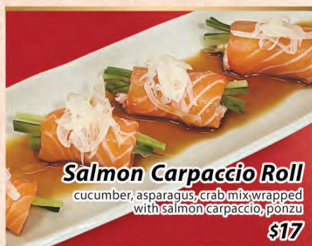
Salmon Carpaccio Roll cucumber, asparagus, crab mix, wrapped with salmon carpaccio, ponzu $17