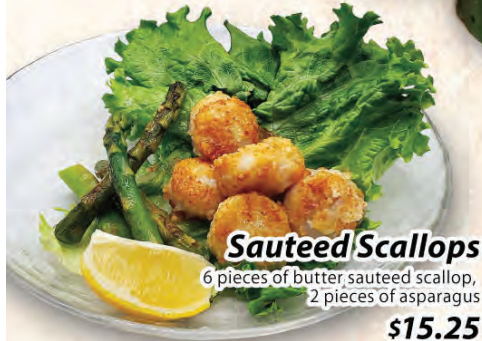
Sautéed Scallops 6 pieces of butter sautéed scallop, 2 pieces of asparagus $15.25