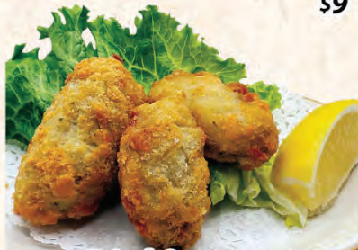
Fried Oyster (Kaki Fry) 3 pieces of fried oyster, tartar sauce $8.95