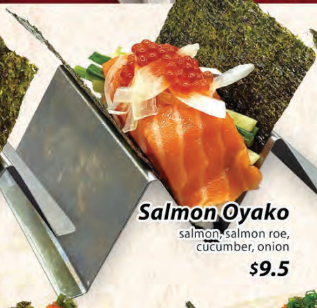
Salmon Oyako salmon, salmon roe, cucumber, onion $9.5