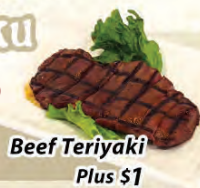
Beef Teriyaki Plus $1

Pick 3 items _____ $24 Beef Teriyaki _____ Plus $1 Sashimi _____ Plus $3 Calamari Steak _____ Plus $3 TOTAL _____ $30