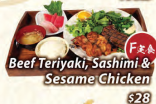
F 定食 Beef Teriyaki, Sashimi & Sesame Chicken $28