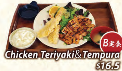
B 定食 Chicken Teriyaki & Tempura $16.5