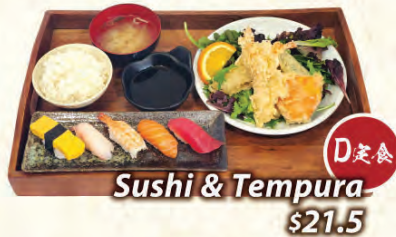
D 定食 Sushi & Tempura $21.5