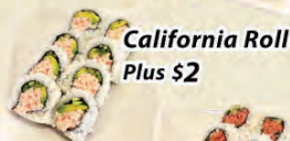
California Roll Plus $2