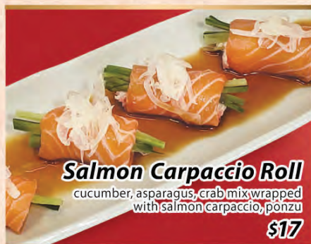
Salmon Carpaccio Roll cucumber, asparagus, crab mix, wrapped with salmon carpaccio, ponzu $17