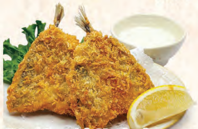
Fried Spanish Mackerel (Aji Fry) 2 pieces of fried spanish mackerel, tartar sauce $8.95