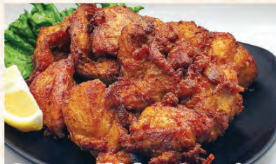
Sesame Chicken Appetizer deep fried sesame chicken $9.75