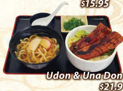
Udon & Una Don $21.9