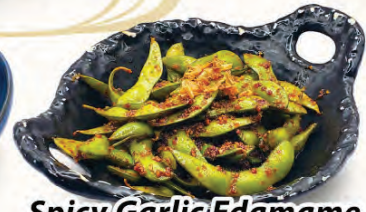
Spicy Garlic Edamame Regular Edamame 6.25 $8.25