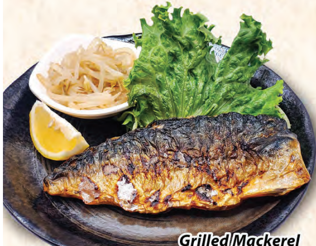
Grilled Mackerel $11.5