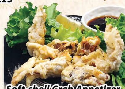
Soft-shell Crab Appetizer deep fried soft-shell crab, ponzu sauce $10.25