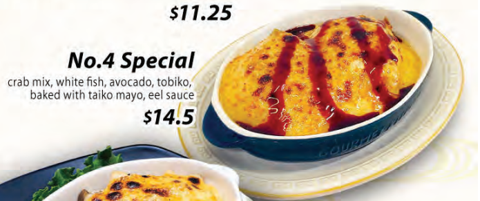
No.4 Special crab mix, white fish, avocado, tobiko, baked with taiko mayo, eel sauce