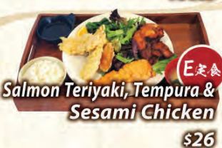
E 定食 Salmon Teriyaki, Tempura & Sesame Chicken $26