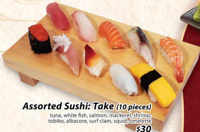
Assorted Sushi: Take (10 pieces) tuna, white fish, salmon, mackerel, shrimp, tobiko, albacore, surf clam, squid, omelette $30