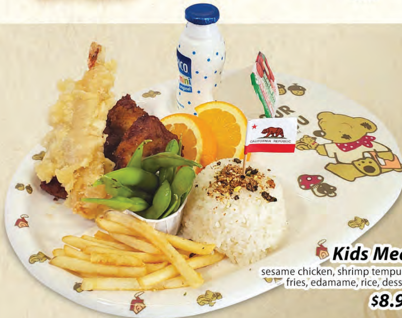
Kids Meal sesame chicken, shrimp tempura, fries, edamame, rice, dessert $8.95