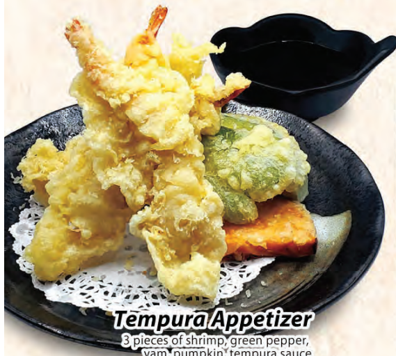
Tempura Appetizer 3 pieces of shrimp, green pepper, yam, pumpkin, tempura sauce $9.75