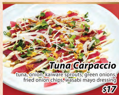
Tuna Carpaccio tuna, onion, kaiware sprouts, green onions, fried onion chips, wasabi mayo dressing $17