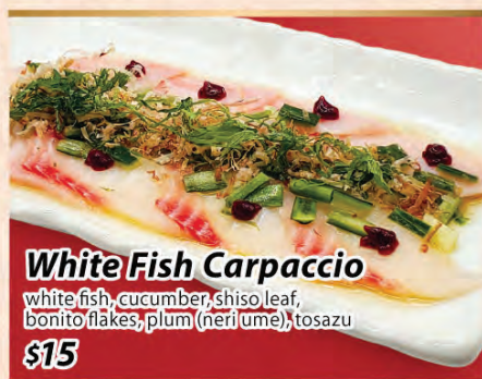
White Fish Carpaccio white fish, cucumber, shiso leaf, bonito flakes, plum (neri ume), toshizu $15