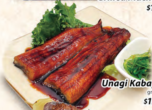
Unagi Kabayaki grilled eel $15.25