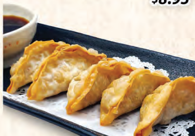
Fried Pork Gyoza (5pc) 5 pieces of fried gyoza, ponzu $9