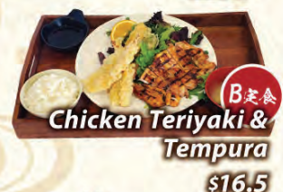
B 定食 Chicken Teriyaki & Tempura $16.5