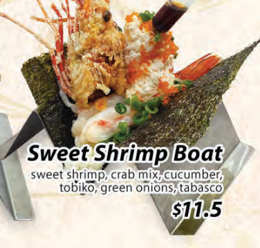
Sweet Shrimp Boat sweet shrimp, crab mix, cucumber, tobiko, green onions, tabasco $11.5