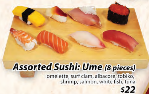
Assorted Sushi: Ume (8 pieces) omelette, surf clam, albacore, tobiko, shrimp, salmon, white fish, tuna $22