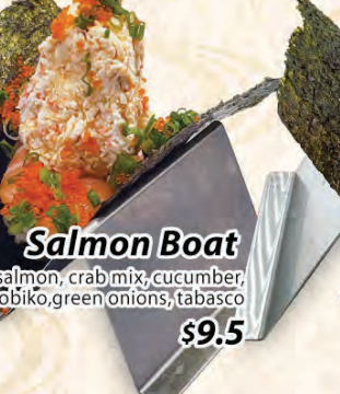
Salmon Boat salmon, crab mix, cucumber, tobiko, green onions, tabasco $9.5