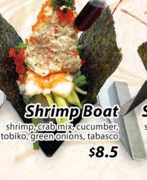
Shrimp Boat shrimp, crab mix, cucumber, tobiko, green onions, tabasco $8.5