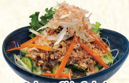
Salmon Skin Salad salmon skin, onion, cucumber, tsuma, yamagobo, bonito flakes, ponzu $13.5