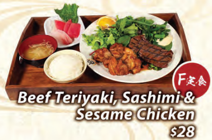
F 定食 Beef Teriyaki, Sashimi & Sesame Chicken $28

Served with Miso Soup & Rice (miso soup is not included for take-out)