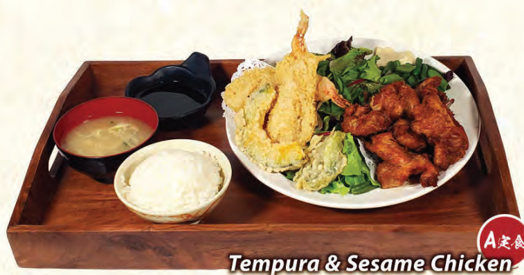
A 定食 Tempura & Sesame Chicken $16.5