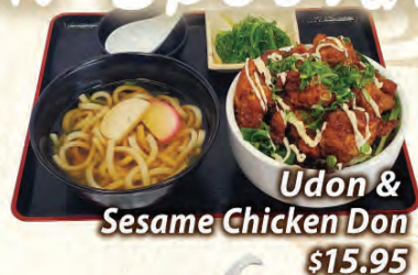
Udon & Sesame Chicken Don $15.95