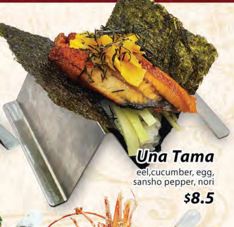
Una Tama eel, cucumber, egg, sansho pepper, nori $8.5