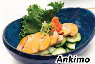
Ankimo steamed monkfish liver, ponzu, green onions, grated radish with red chili (momiji oroshi)