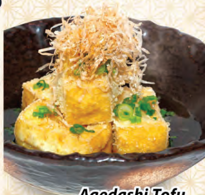
Agedashi Tofu deep fried tofu, bonito flakes, green onions, ginger, dashi soup (soy sauce, mirin, sake, fish) $8.25