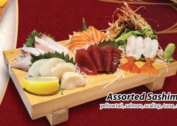
Assorted Sashimi 5 TEN yellowtail, salmon, scallop, tuna, sweetshrimp $40