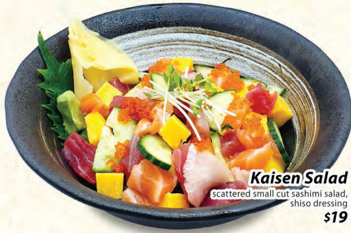
Kaisei Salad scattered small cut sashimi salad, shiso dressing $19