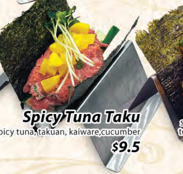
Spicy Tuna Taku spicy tuna, takuan, kawaiere, cucumber $9.5