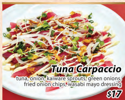
Tuna Carpaccio tuna, onion, kaiware sprouts, green onions, fried onion chips, wasabi mayo dressing $17