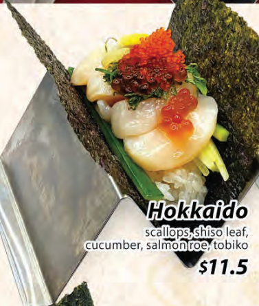
Hokkaido scallops, shiso leaf, cucumber, salmon roe, tobiko $11.5