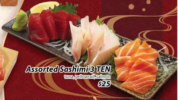
Assorted Sashimi 3 TEN tuna, yellowtail, salmon $25